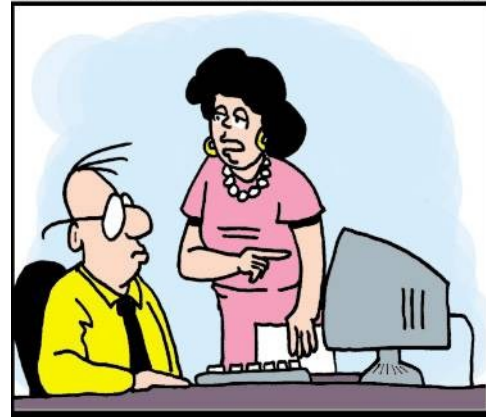
I finally found out why your sermon files keep disappearing... we installed a new "spam filter."

Non Profit Org. U.S. Postage PAID Permit #206 Greensboro, NC